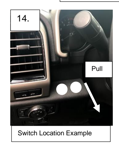
Interior Firewall Passthrough (Use lube when reinstalling)

Re-torque all the fasteners after 100 miles.